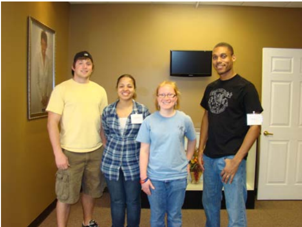
Some of the KSU Student Volunteers